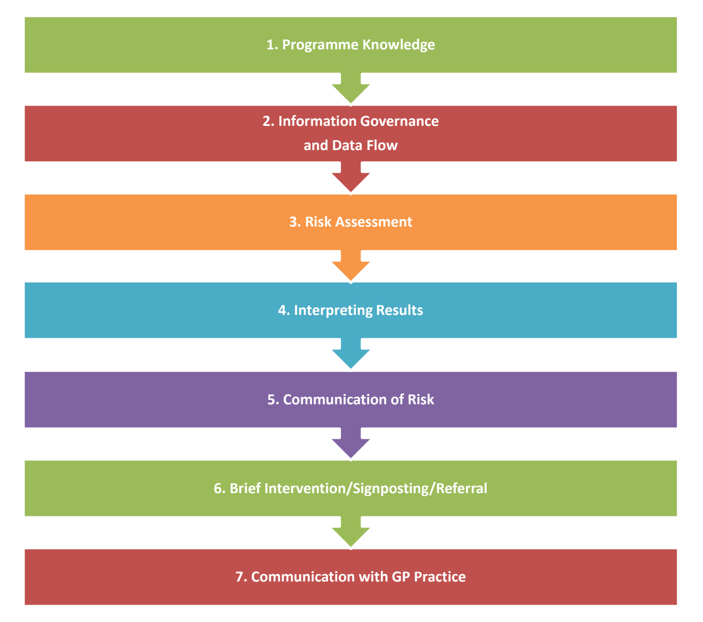
Figure 1. List of NHS Health Check programme competencies

In addition to the core competencies (Care Certificate or equivalent) and clinical skills competencies described in 2.3, staff carrying out an NHS Health Check must be able to demonstrate that they meet the NHS Health Check programme competencies.